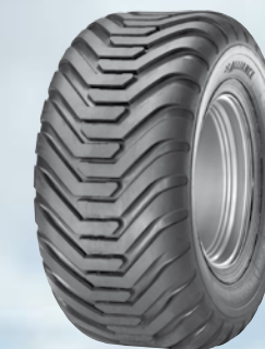
Alliance Flotation 328

Large-volume tyres reduce the tractive power requirement and prevent soil compaction even under wet conditions. The relatively large contact area minimises rolling resistance so the tyres keep rolling even under difficult conditions.