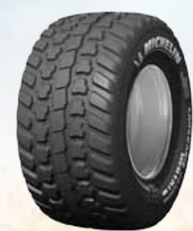
Michelin CARGO X BIB High Flotation