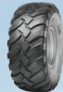
BKT FL 630 Super