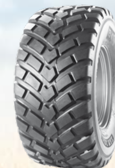
BKT RIDEMAX FL 693 M